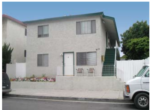
Mary Lou House – 917 South Palos Verdes Street, San Pedro

The Board of Directors and staff of House of Hope are honored by the trust placed in them by the McMillen Family Foundation and the William A. and Mary L. Steinmetz Living Trust.