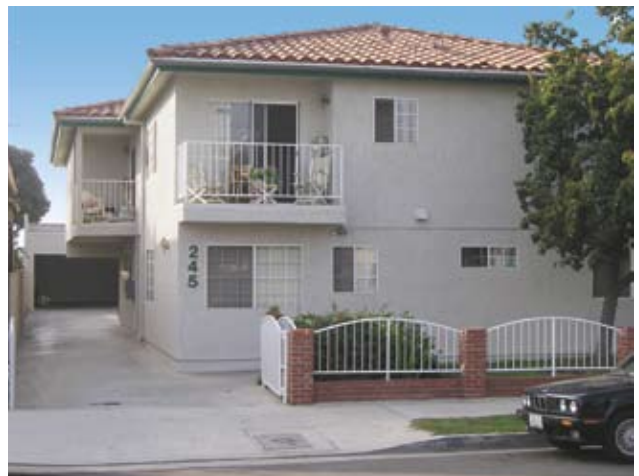
McMillen House – 245 W. 10th Street, San Pedro